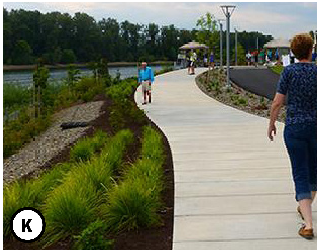
Updated River Front