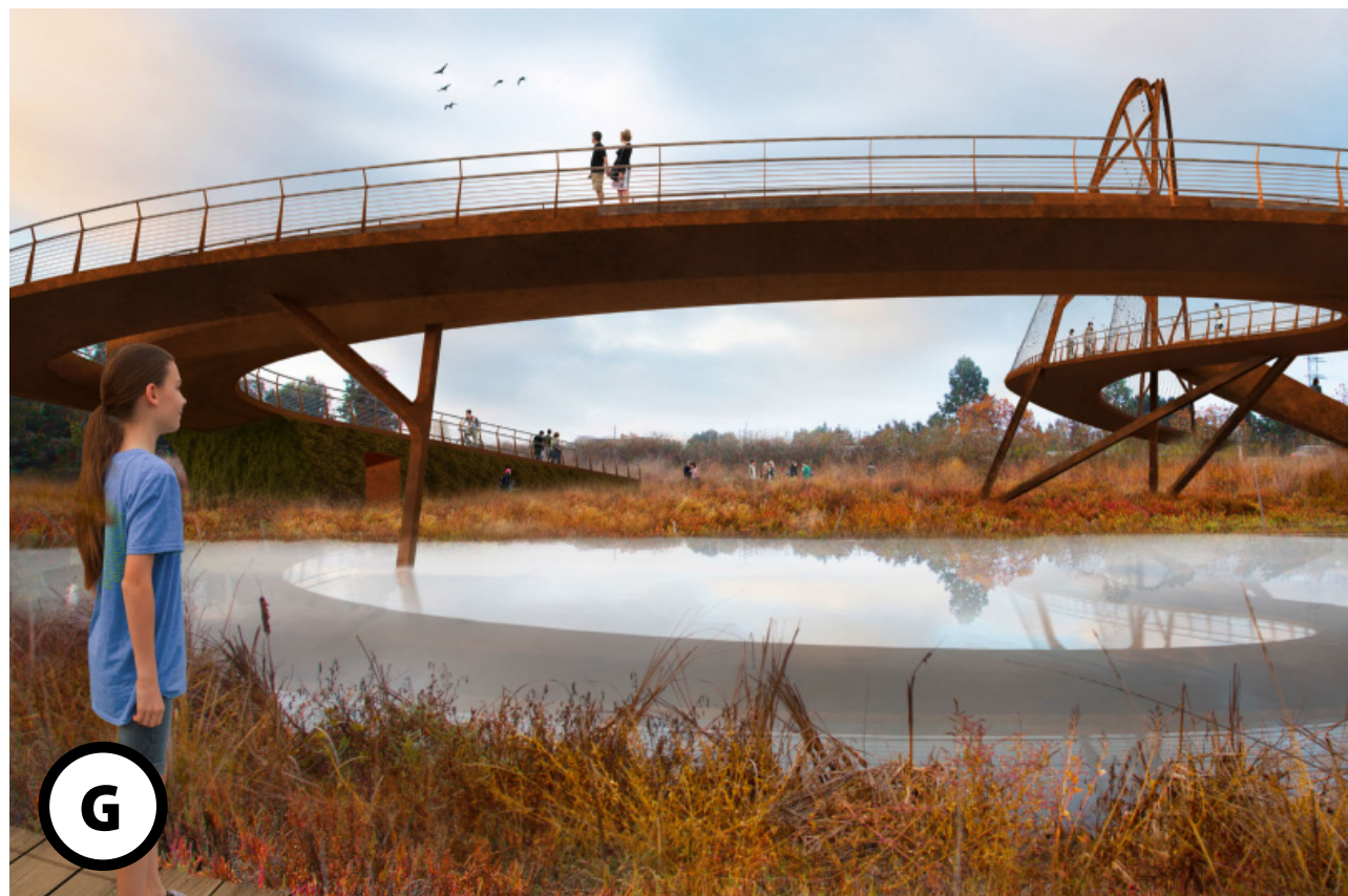
Ped/Bike Bridge + Stormwater