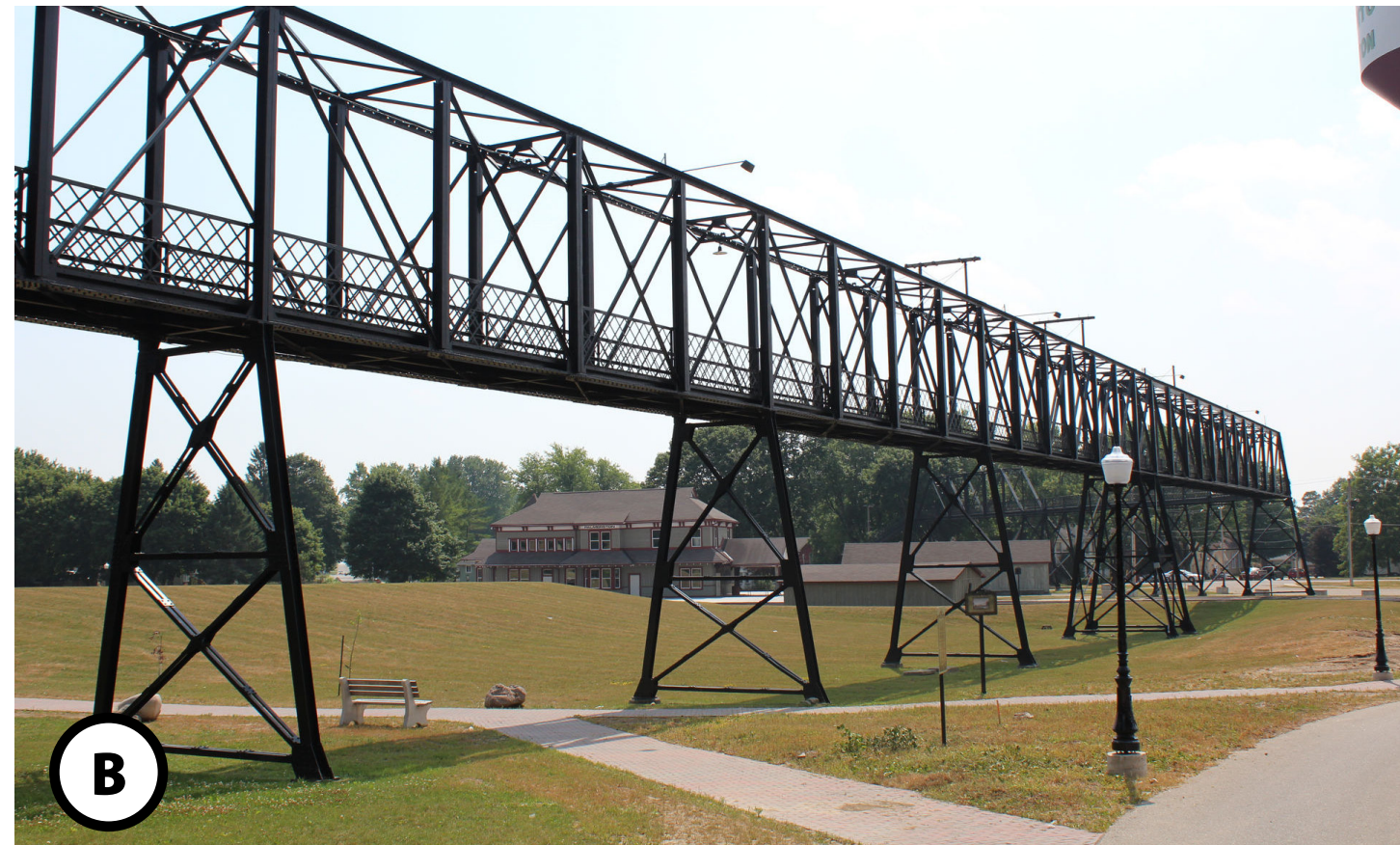
Ped & Bike Bridge