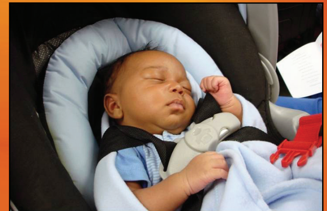
NEVER leave a baby, senior or pet locked in a car, even for a few minutes. Dozens of infants and untold numbers of pets die every year in hot vehicles.