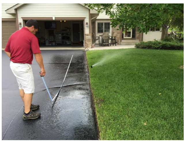
IMPROPERLY ADJUSTED SPRINKLER

Water use in the home landscape is a hot topiceven in Minnesota. In the Twin Cities, on average three times more water is used during the summer than in the winter and much of this water is used outdoors. As urbanization increases and we continue to experience more extreme heat and drought, greater pressure is placed on our water resources. If you own an irrigation system or water your lawn with portable sprinklers, reduce your overall water use by implementing the following water-saving tips.