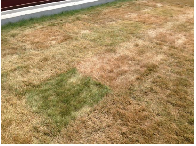
RESEARCH AT THE U OF M HAS IDENTIFIED FESCUES AS THE MOST DROUGHT TOLERANT FOR LAWNS