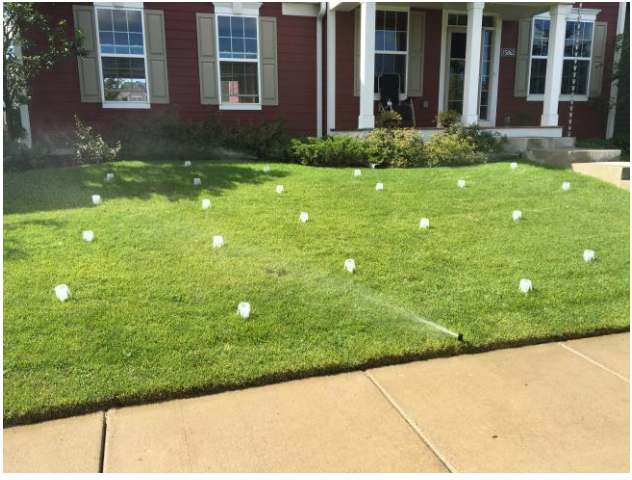
IRRIGATION SYSTEM AUDITING

Audit your irrigation system: Auditing your irrigation system is a good step toward water conservation. Irrigation contractors will perform this service for you if you contract with them. There are three basic steps: 1) check system components including sprinklers, valves and controllers; 2) conduct a performance test, and 3)