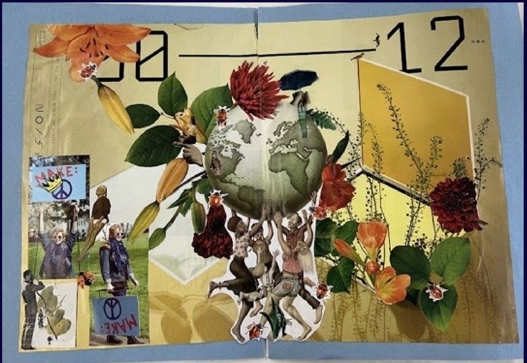
Ella Clancy - "Flowering"