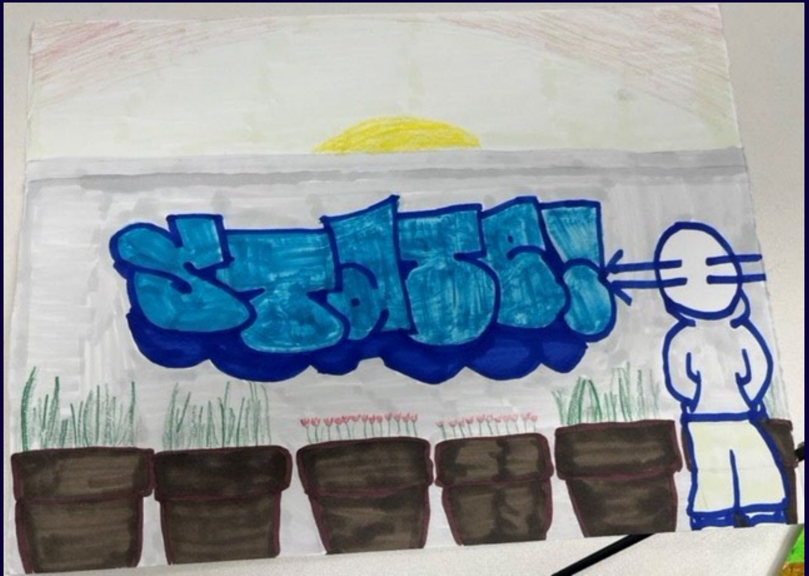
Mason Hallock - "Keep it Clean"