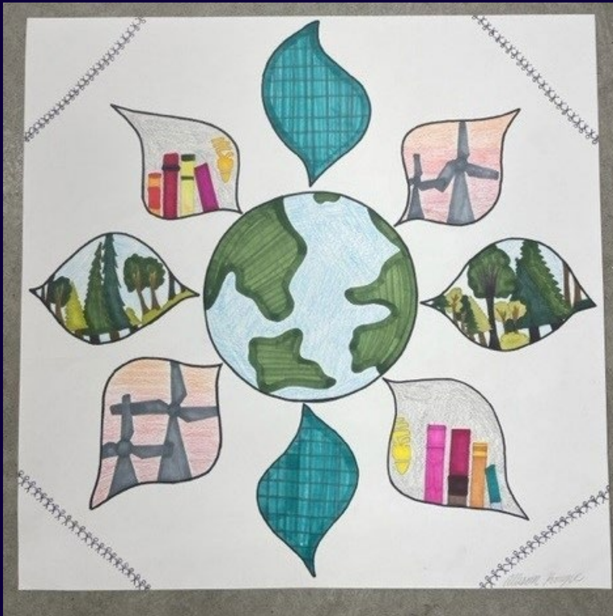
Allison Kruger “Growth”