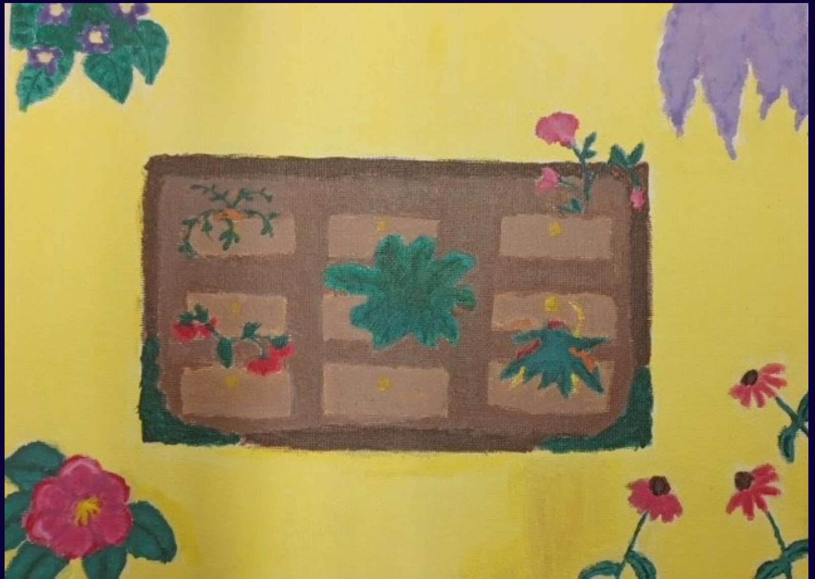
Ava Northey - "Seed Bank"