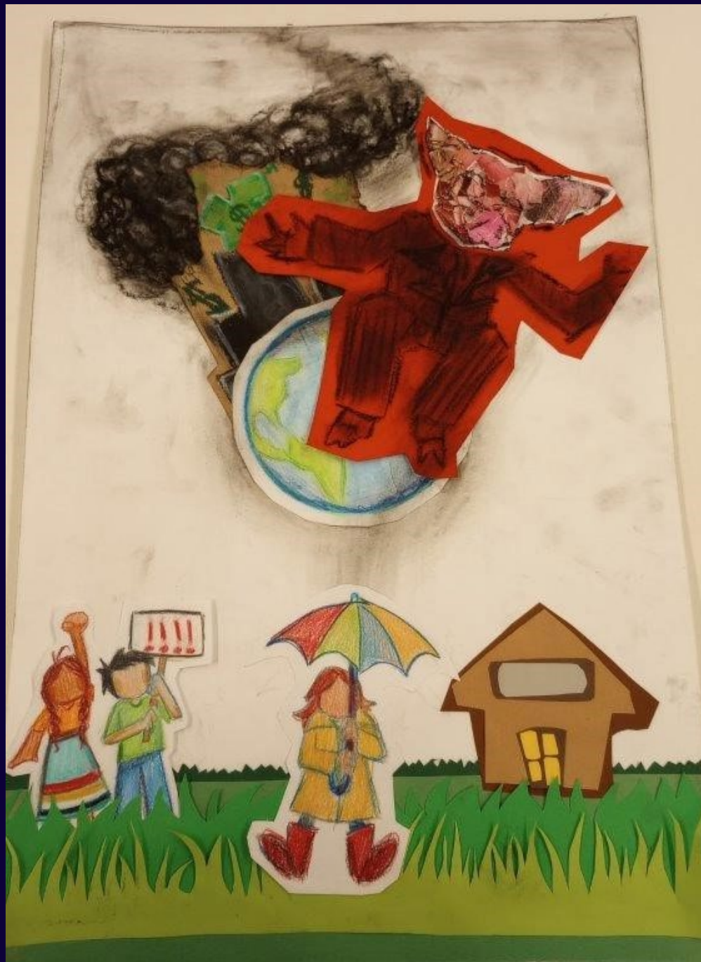
Kris Nepoose “World of Their Own”