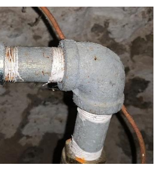
Galvanized Scratch Test: The pipe does not scratch easily and remains a dull gray.