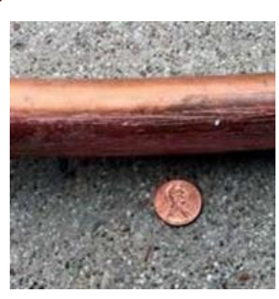
Copper Scratch Test: The scratched area is copper color, like a penny.